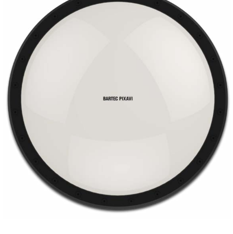
« No more 50 kg steel enclosures. This is a revolution! »